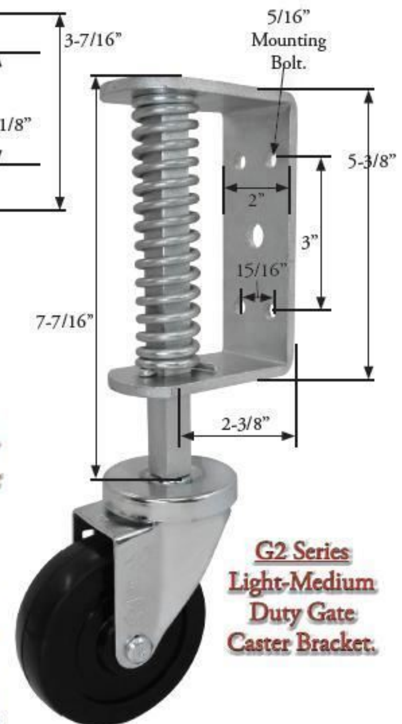
G2 Series Light-Medium Duty Gate Caster Bracket.

Any caster with appropriate fastening and swivel radius less than the "Rotating Spacing", may be inserted into the G1 & G2 series Brackets. Any 6 x 2 or 8 x 2 wheel may be used in the G3 Series Bracket.