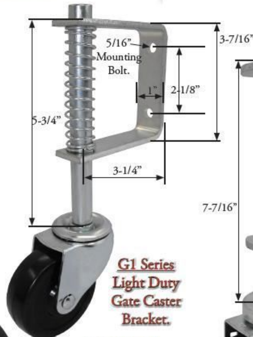
G1 Series Light Duty Gate Caster Bracket.

Any caster with appropriate fastening and swivel radius less than the "Rotating Spacing", may be inserted into the G1 & G2 series Brackets. Any 6 x 2 or 8 x 2 wheel may be used in the G3 Series Bracket.